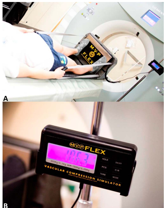
Figure 1. Patient positioning for CTA stress imaging. (A) The patient is positioned supine on the MVP Flex with the hand straps taut and feet plantar flexed against the pressure plate. B, Plantar flexion force generation was maintained between 100 and 140 pounds CTA, CT angiography.

were placed against the pressure plate. A test of positioning was performed by having the patient plantar flex against the pressure plate. A force of 100 to 140 pounds was required and noted on the pressure monitor (Figure 1B). This force range was developed based on the average vertical ground reaction force during the running cycle for an average patient. 20–23 The patient held the plantar-flexed position within this pressure range for 60 seconds. The onset of symptoms was noted during the initial test. Adjustments in positioning were made as needed. After proper positioning, the patient released the hand grips and placed their feet against the MVP Flex pad at rest. A pressure reading of 0 pounds was confirmed on the monitor. Resting CTA images of the arterial and venous system of both legs were obtained to confirm normal resting